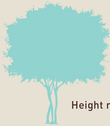
Height range 15-30'