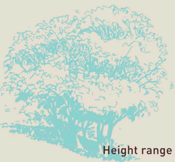
Height range 30-60'